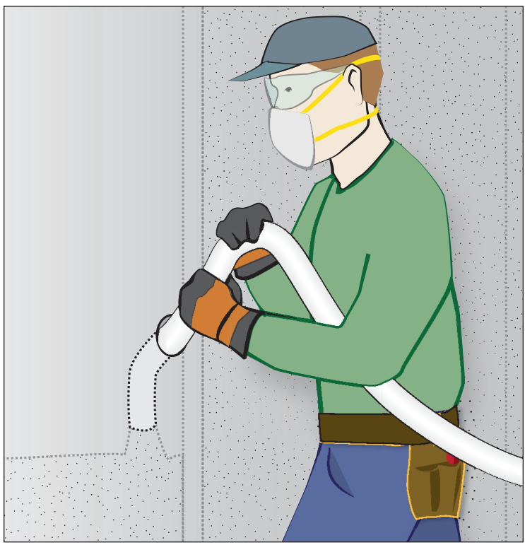
Holes drilled through interior walls allow insulation to be blown into wall cavities

Exterior installation is usually done for homes with siding and where the grade around the home is not too challenging for installers to work from ladders. A row of the siding is usually removed and holes drilled through the wall sheathing between each stud cavity. The holes in the sheathing can be easily patched and siding replaced.